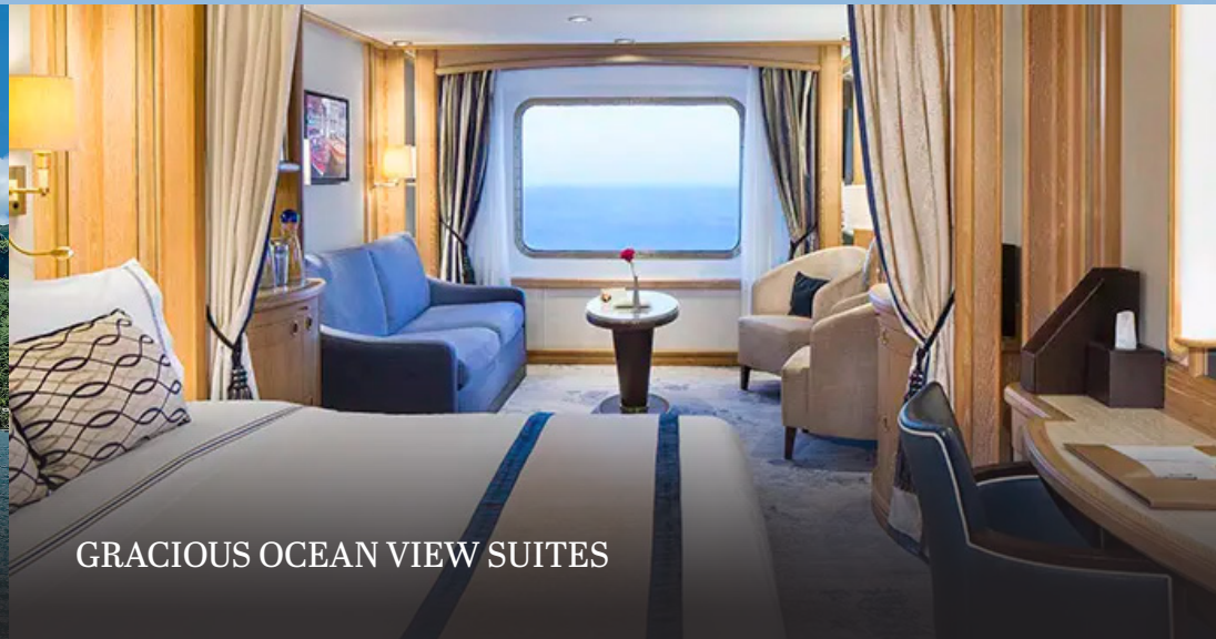
GRACIOUS OCEAN VIEW SUITES